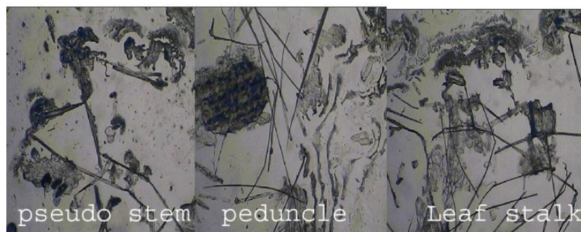
Figure 1. Microphotograph of pulps from different parts of banana plant.